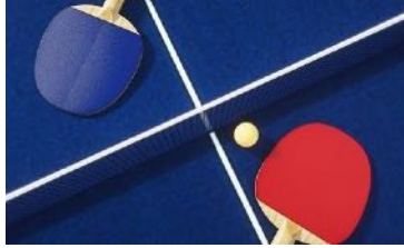
Table Tennis is one of the most popular sport in China. It combines technique, spin, power, touch and concentration. The course contents include: basic strokes, footwork, drills, strategies, rules and necessary etiquette to participate actively and enjoy the games.

乒乓球是中国最受欢迎的运动之一。它结合了技术、旋转、力量、触摸和专注。课程内容包括：基本击球、步法、练习、策略、规则和必要的礼仪规范。俱乐部会让学生们积极参与并享受比赛。